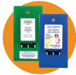
All products are available in green and blue.